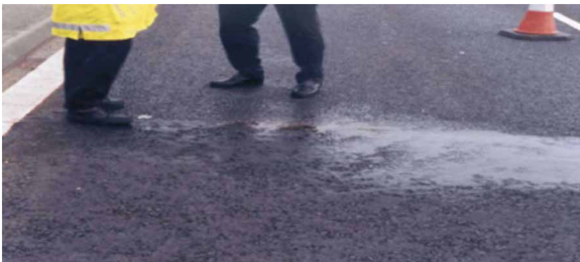
Figure 8.4.4 - Water ponded on surfacing at interface between a negatively textured thin surfacing and dense surfacing

In other situations, salt in solution can be ‘pumped’ back to the surface by the action of traffic, but this effect will not be significant if the level of traffic is low and this mechanism should not be relied upon because of the uncertainties involved.